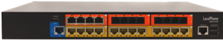
LocaPhone M800 VoIP PBX Appliance